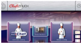
Chef's Touch control: Just tap and swipe to run built-in apps

The FlexFusion Team combi Platinum Series features two independent Chef'sTouch control systems on one convenient eye-