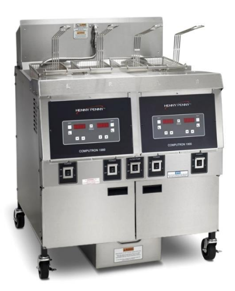
OFE 322 2-well electric open fryer with split vats and Computron<sup>™</sup> 1000 control

Henny Penny open fryers offer high-volume, integral multi-well frying with programmable operation, oil management functions and fast, easy filtration.