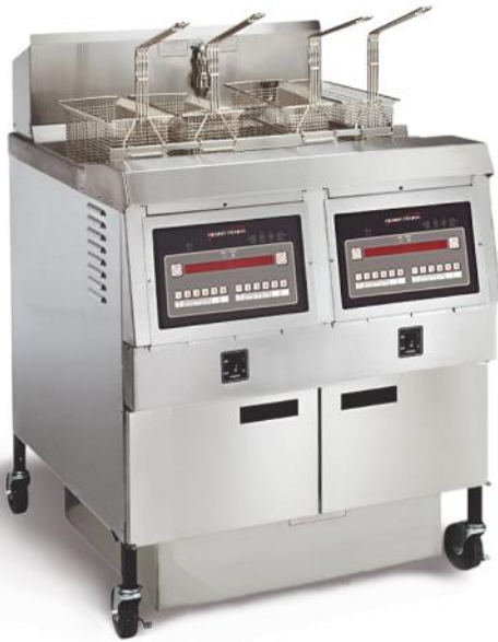
OFG 322 2-well gas open fryer with Computron™ 8000 control

Henny Penny open fryers offer high-volume, integral multi-well frying with programmable operation, oil management functions and fast, easy filtration.